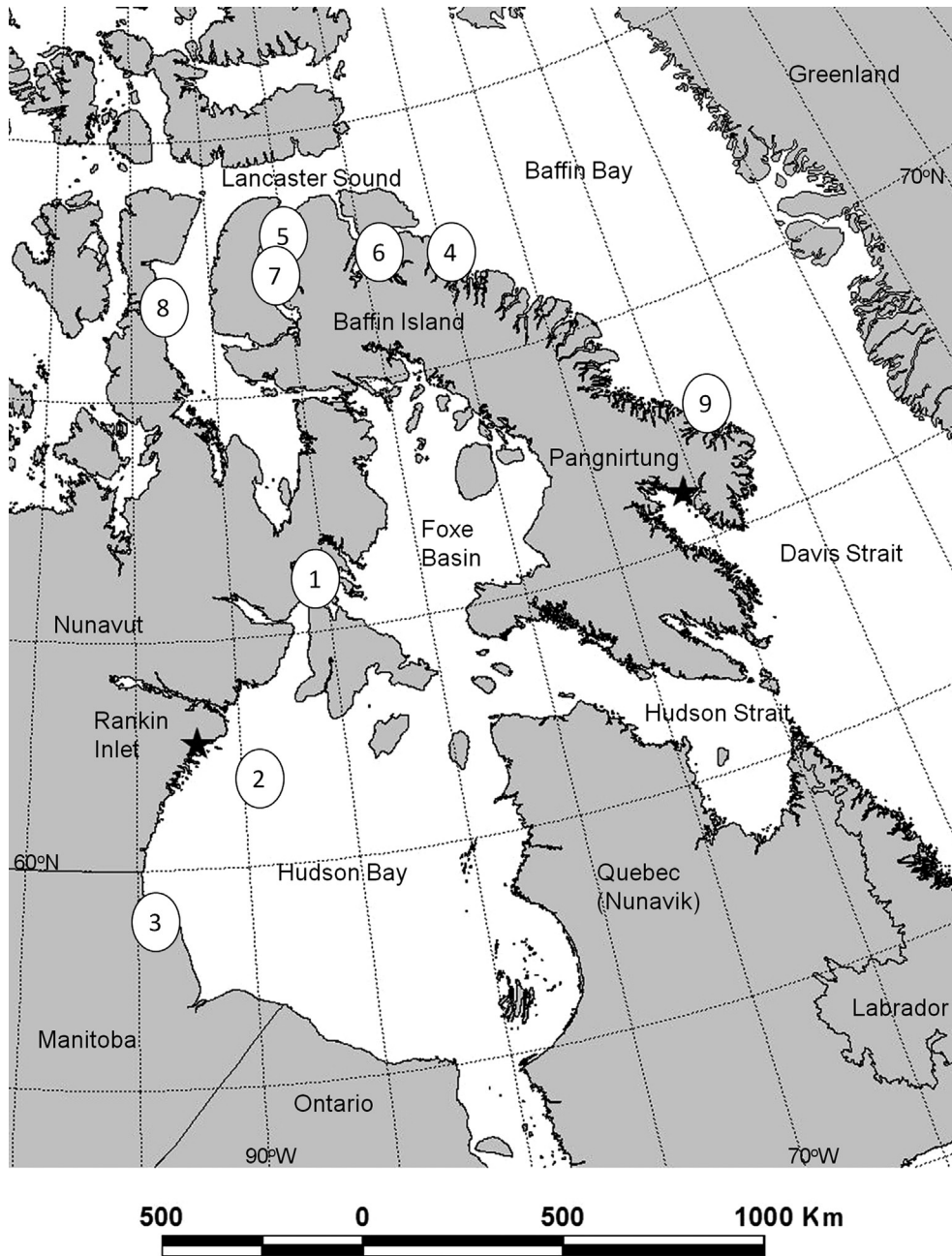
Fig. 1 Locations of photographed killer whale ( Orcinus orca ) sightings in the eastern Canadian Arctic between 2004 and 2009. The numbers on the map correspond to the sightings presented in Table 1.

tung, Nunavut, in 2008 (Fig. 1) were not included in the analyses because they contained only poor quality photographs or non-distinctive individuals. Out of the 53 identified whales, 11 were from western Hudson Bay and 42 were from northern and eastern Baffin Island (Table 1). A discovery curve (Fig. 2) shows a strong linear increase in the number of identified individuals, suggesting that the actual number of killer